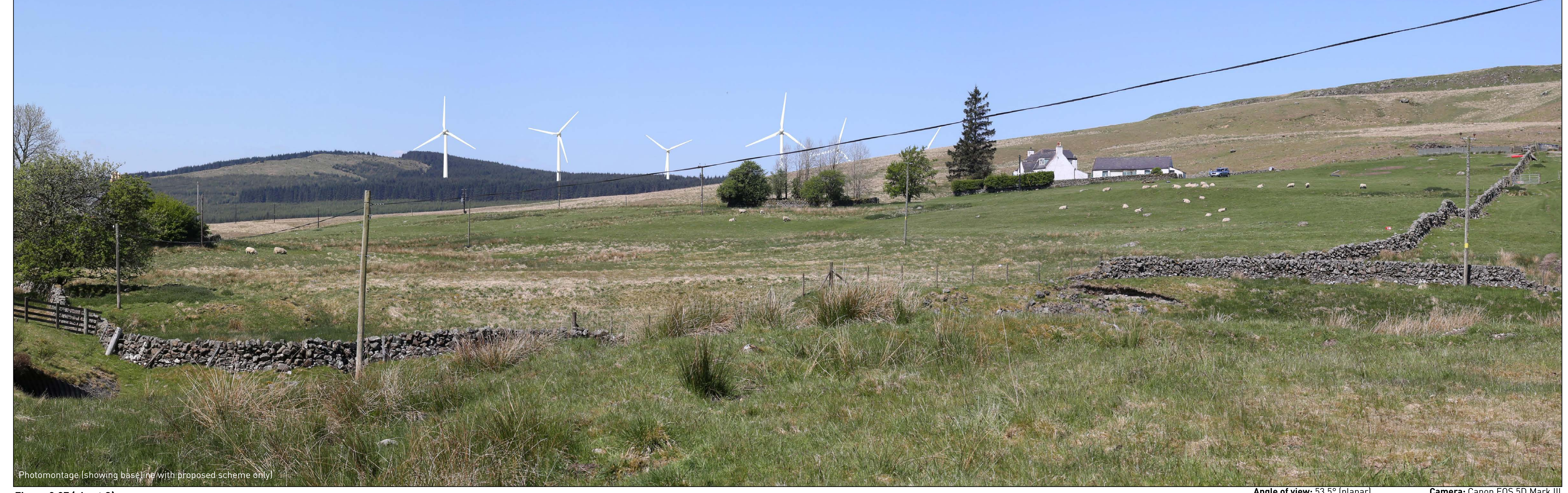
Figure 8.37 (sheet C) Viewpoint 1: Stroanfreggan Bridge SHEPHERDS' RIG WIND FARM